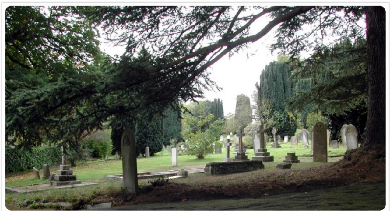
Forest Row cemetery

http://www.ashdownforest.org/enjoy/history/AshdownResearchGroup.php